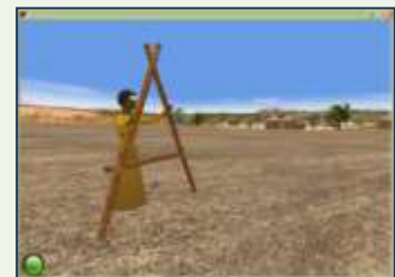
Field surveying for water conservation – practice follows theory