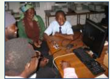
All together now - Rusike

Strong links with local extension officers was also established, in particular AGRITEX, who took the lead in explaining the agricultural principle behind the i3dlo's presented.